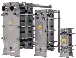
Sanitary Plate & Frame