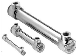
Sanitary Shell & Tube